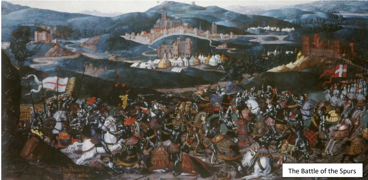
The Battle of the Spurs

Henry VIII, unlike his father Henry VII, was keen to go to war with the French and make good his claim to be king of France. In June 1513 he invaded France with a huge army after having spent amazing amounts of money preparing. Although his forces won a skirmish known as the battle of the Spurs and took the French town of Tournai, this was a poor return for the money spent, and nor did Henry get the glory he craved. Even though the Queen of Scotland was Henry VIII's sister, the Scots invaded England while Henry was away in France. They were beaten at the battle of Flodden on 9 September 1513, where King James IV was killed.